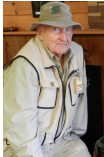
Our Logo Model