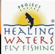
Winter Dinner in Toronto